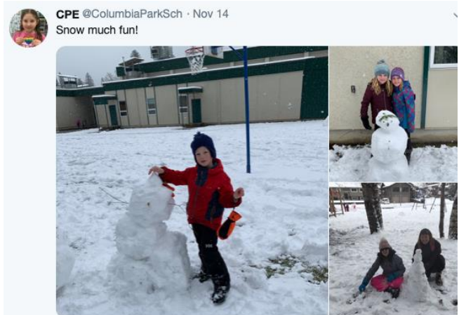
CPE @ColumbiaParkSch · Nov 14 Snow much fun!